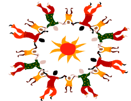
Women Working Together!

Since 2005, this group has been actively meeting and planning community events and workshops for women.